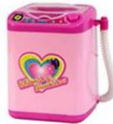
Makeup Brush Cleaner Device Automatic Cleaning Washing Machine Mini Toy Girls Toy Educational... ★★★★☆ 3 $2.99