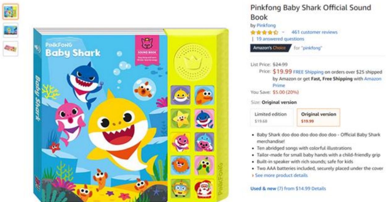
버튼을 누르면 노래가 나오는 핑크퐁의 사운드북

동요계의 <강남스타일>, 어린이들의 BTS! 바로 <아기상어> 노래입니다. 스마트스터디의 유아동 브랜드인 '핑크퐁'이 유튜브에 올린 영어 버전 영상은 벌써 30억 조회수를 넘었습니다. 아마존에서도 그 인기를 실감할 수 있었는데요.