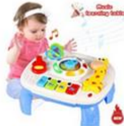
HOMOFY Baby Toys Musical Learning Table 6 Months Up- Early Education Activity Center... ★★★★☆ 106 $26.99