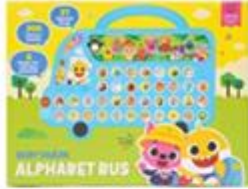
Pinkfong Baby Shark Official Alphabet Bus $49.99